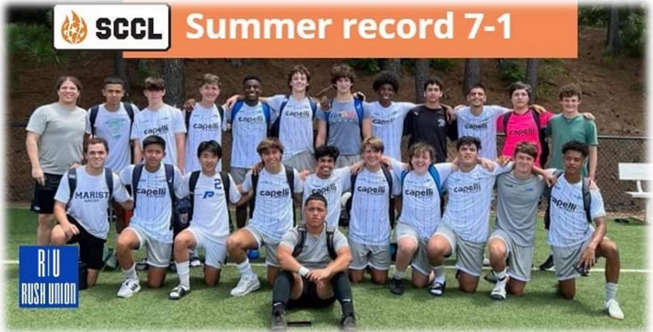
Congratulations to our SCCL Summer League Champions above, and our Adult Summer League Champions below. A great way to finish our the summer.