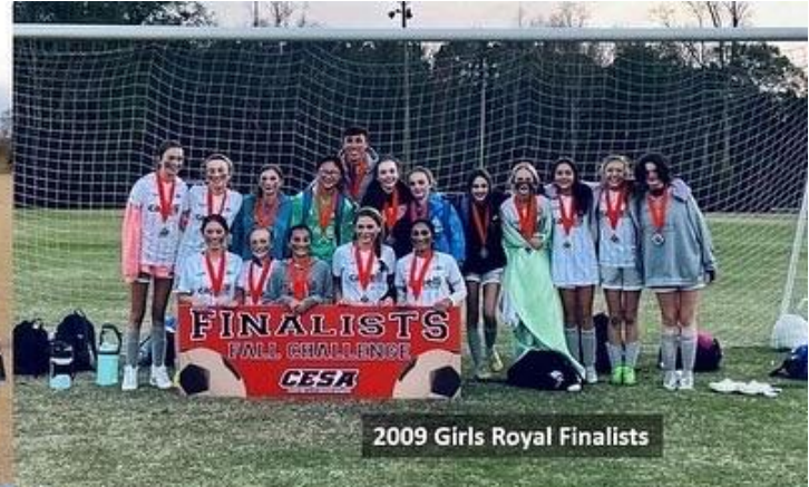
2009 Girls Royal Finalists