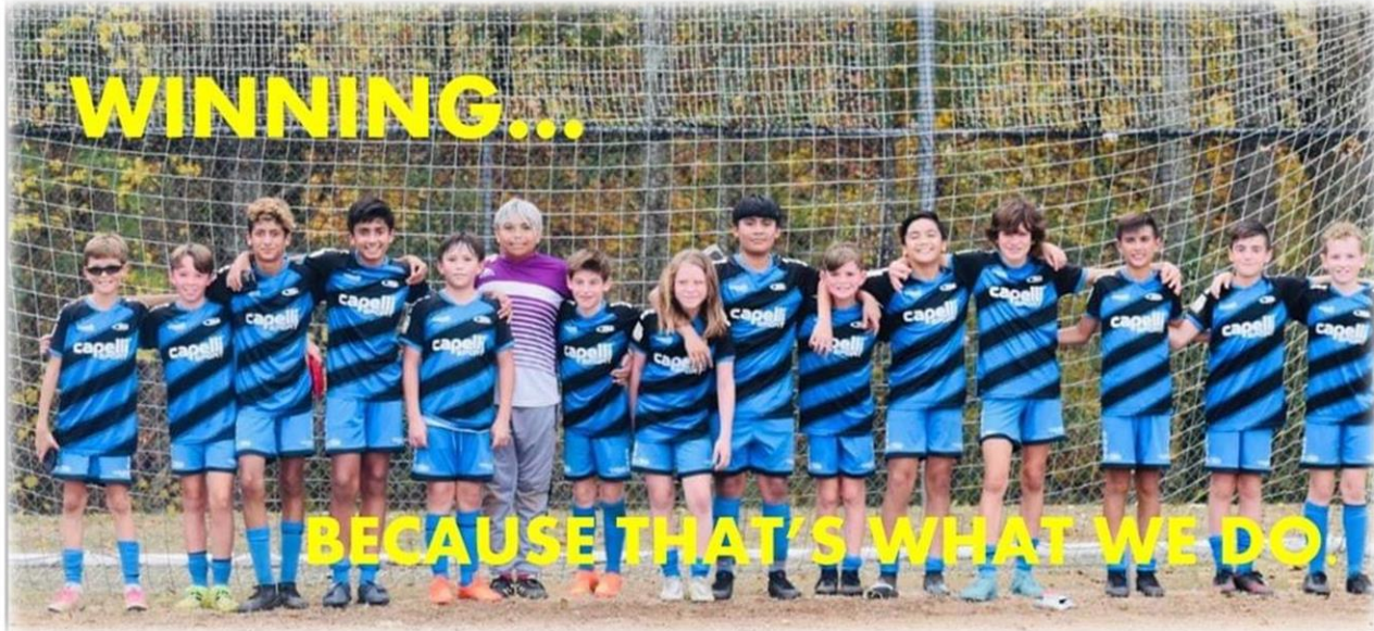
The 2010B Rush team won the SCCL Champions division going undefeated this season (above) and our Coaches enjoyed participating in the FX Cup for Charity (below)