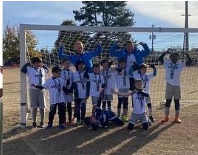
2013 Boys Black Champions