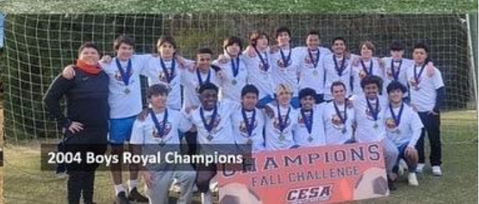
2004 Boys Royal Champions

A great showing in South Carolina at CESA (Above) and in Florida at the IRC (Below)