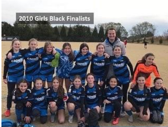
2010 Girls Black Finalists