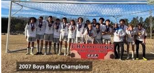
2007 Boys Royal Champions