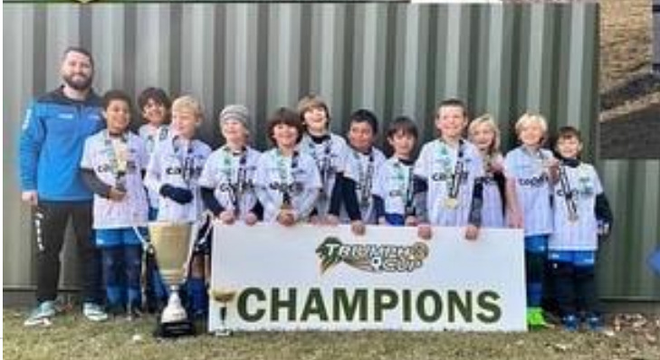
2014 Boys Black Champions