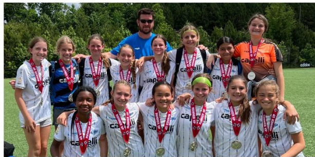
More end of spring Tournament success!