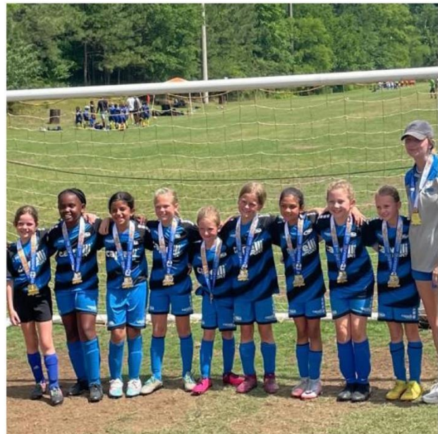
Even more end of spring tournament success!