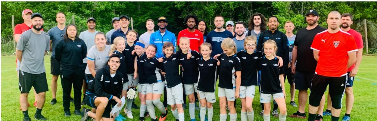
Coaches at our Milton Facility going through their paces during a 7v7 USSF Grassroots Coaching Course in April.